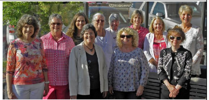
The "Better Halves"