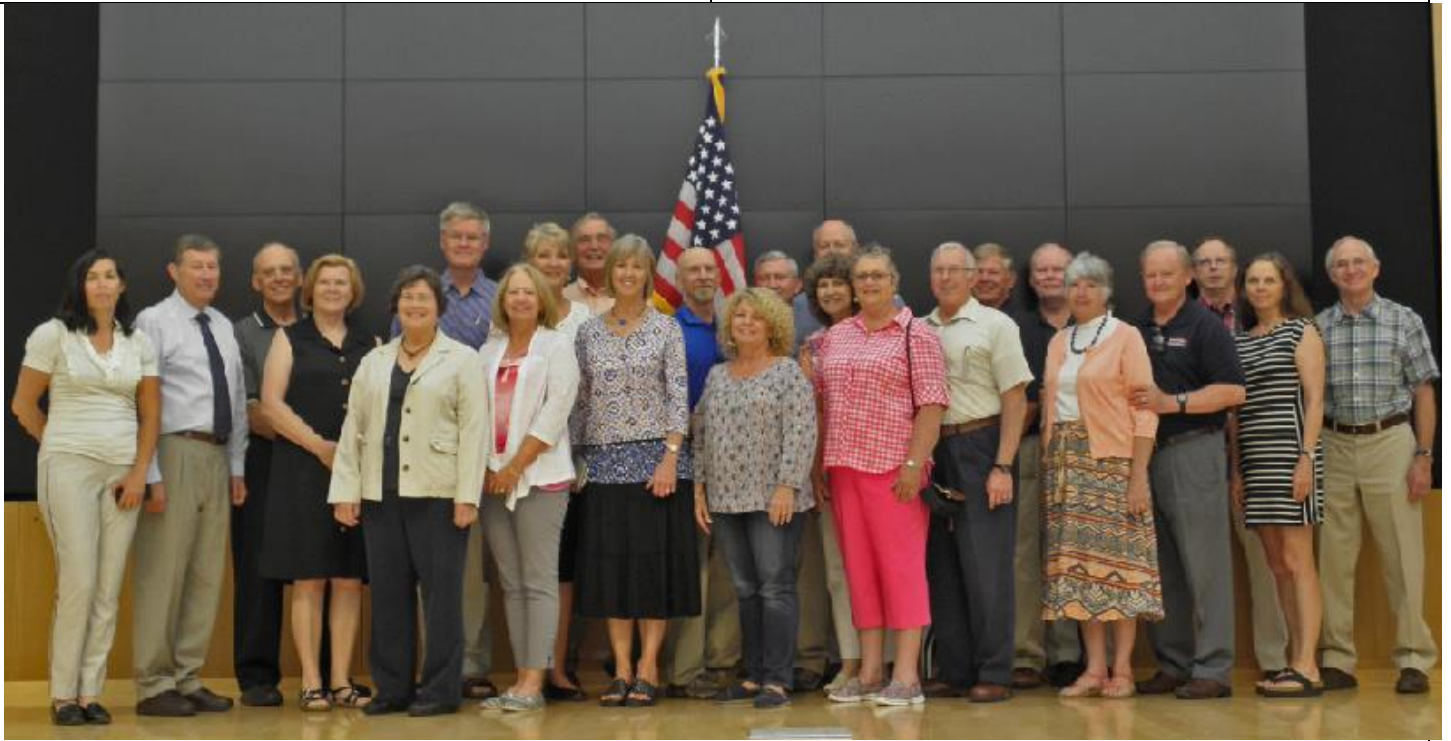
Visitors from "The Illustrious Class of '73" with spouses and guides

Link to architects Skidmore Owings and Merrill (SOM) presentation for CCLD