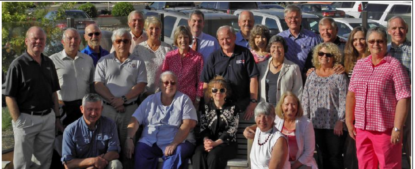
The Whole Group