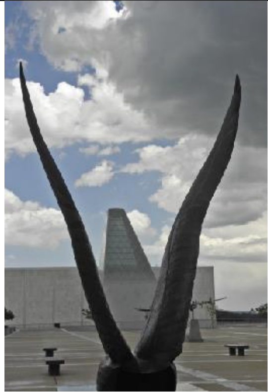
View from Chapel Plaza