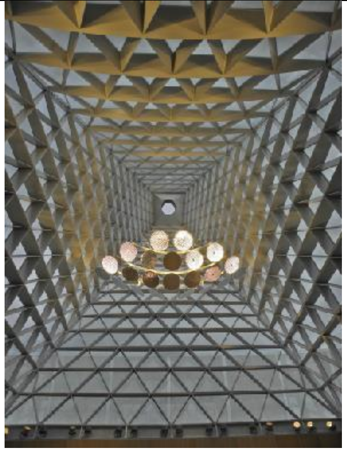
Skyward View - Interior of Honor Tower