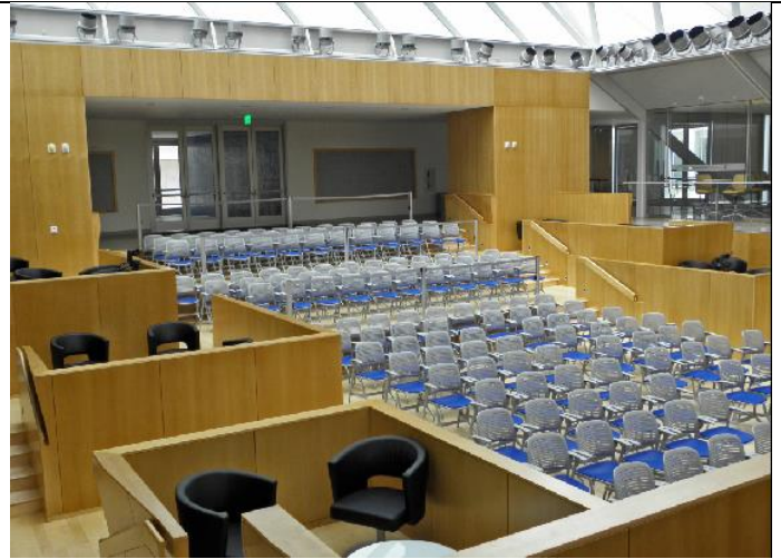
The central Forum will seat approximately 200