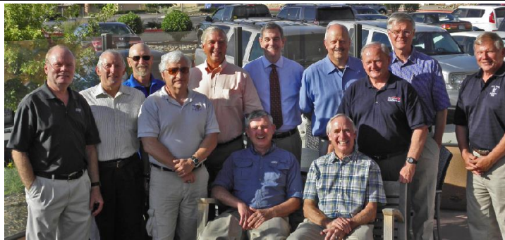
A "Dirty Dozen" Classmates gathered on the patio at Colorado Mountain Brewery