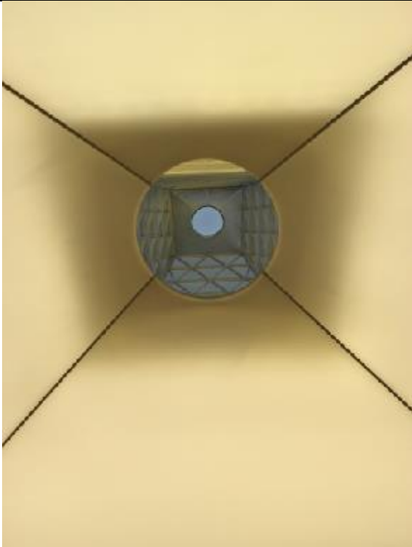
View through the Oculus – Fixed on Polaris