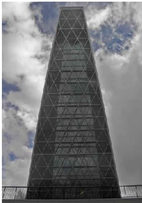
While the monolithic glass tower soars above