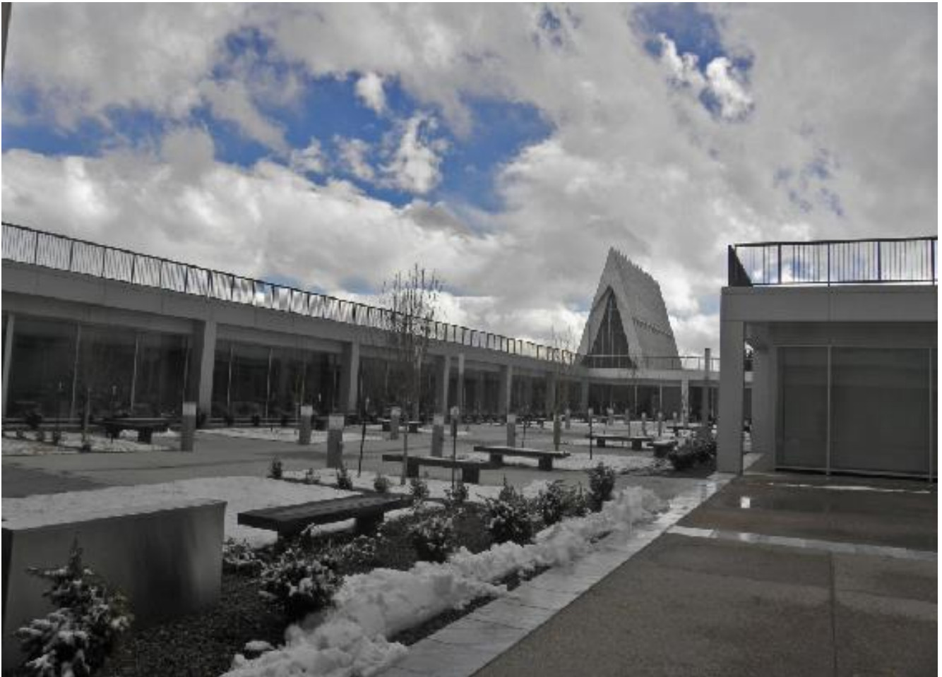
Twin “Air Terraces” (East and West) flank the lower level of Polaris Hall