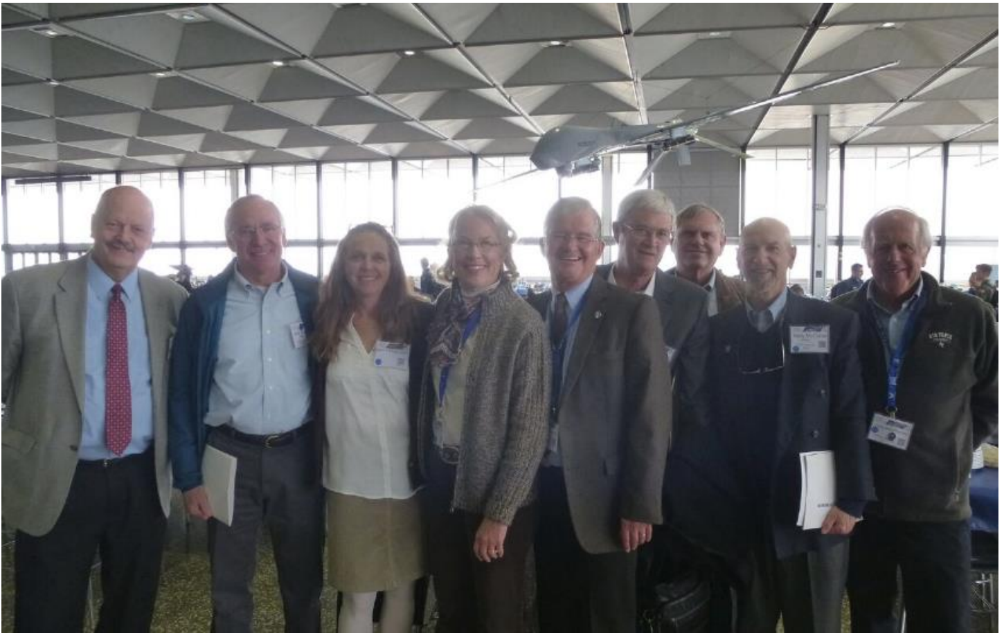
A group from “The Illustrious Class” enjoyed lunch at Mitch’s with Cadets from their old Squadrons Another group at the formal dinner in Arnold Hall on Thursday night.