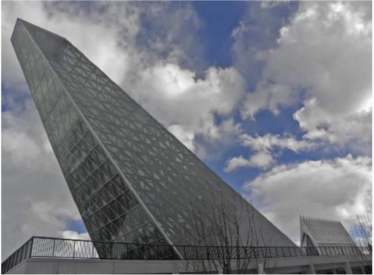
Angled at 39^\circ to align with the North Star, reflections from the new Polaris Hall are constantly changing