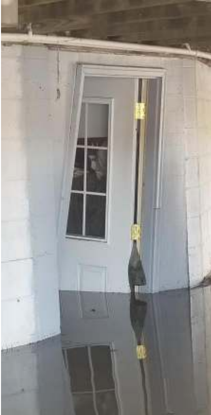
The water forced open the basement door (left), eventually reaching 78" in depth (below) on 16 Mar 2019.