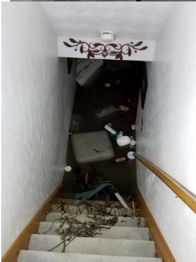
Looking down the stairwell into the basement (left). Note the debris on the stairs; the water has receded some. Below, family room disarray in the basement, water still in the room.